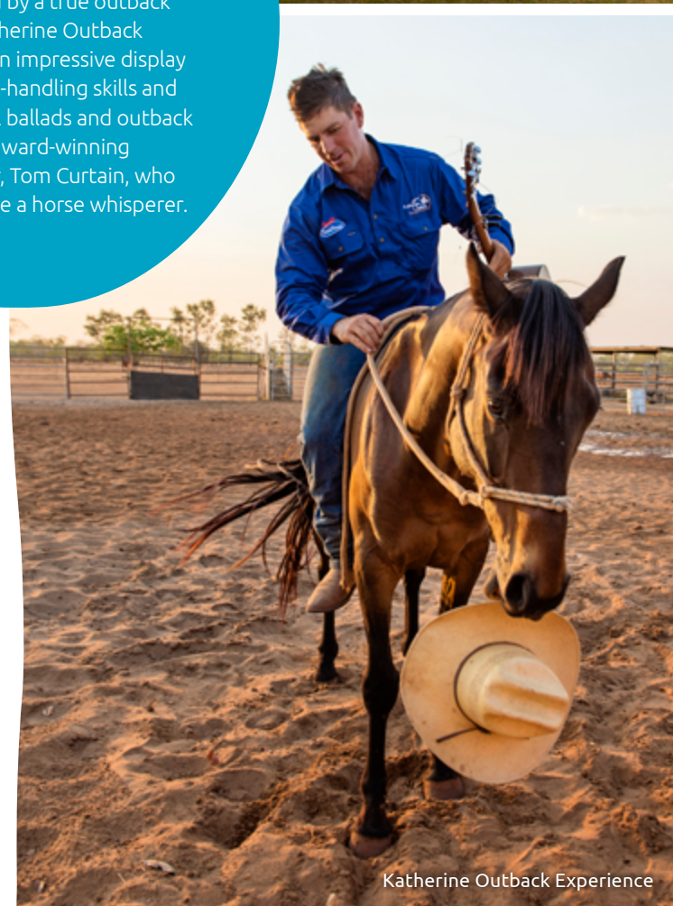
Katherine Outback Experience