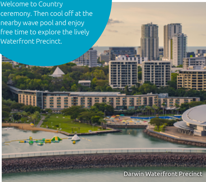
Darwin Waterfront Precinct