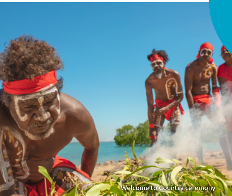
Welcome to Country ceremony