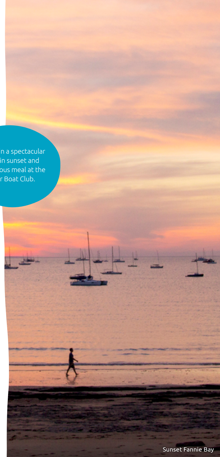
Sunset Fannie Bay