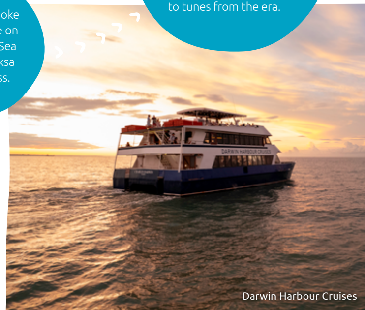
Darwin Harbour Cruises