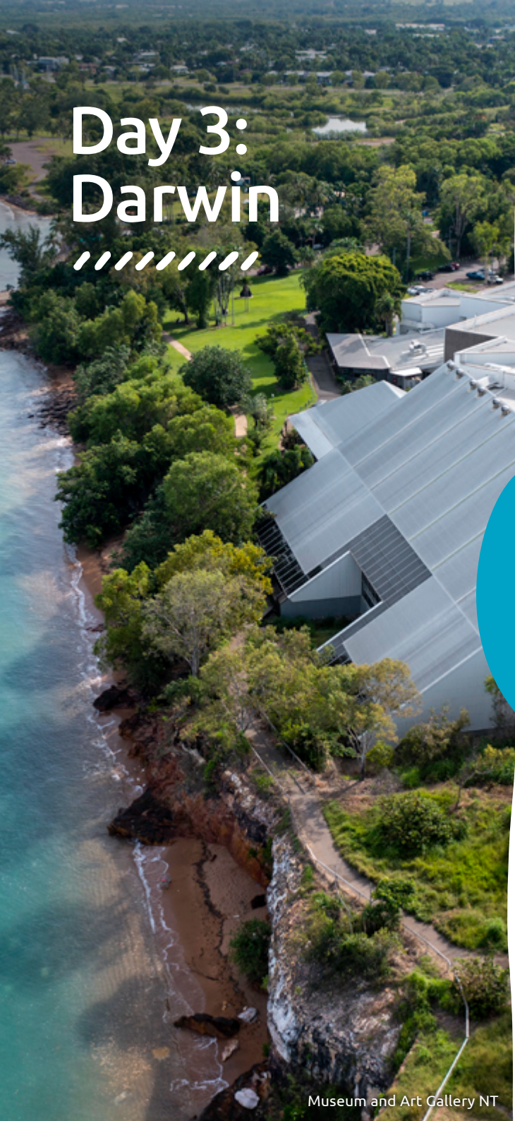
Museum and Art Gallery NT