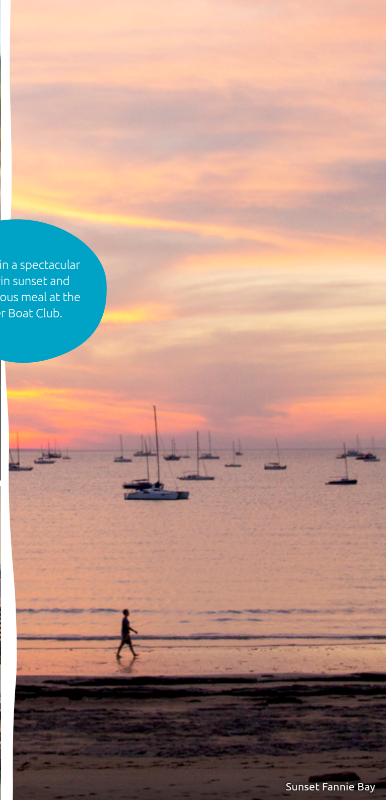
Sunset Fannie Bay