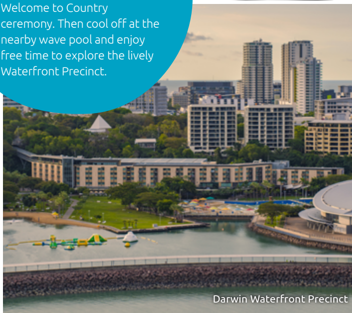
Darwin Waterfront Precinct