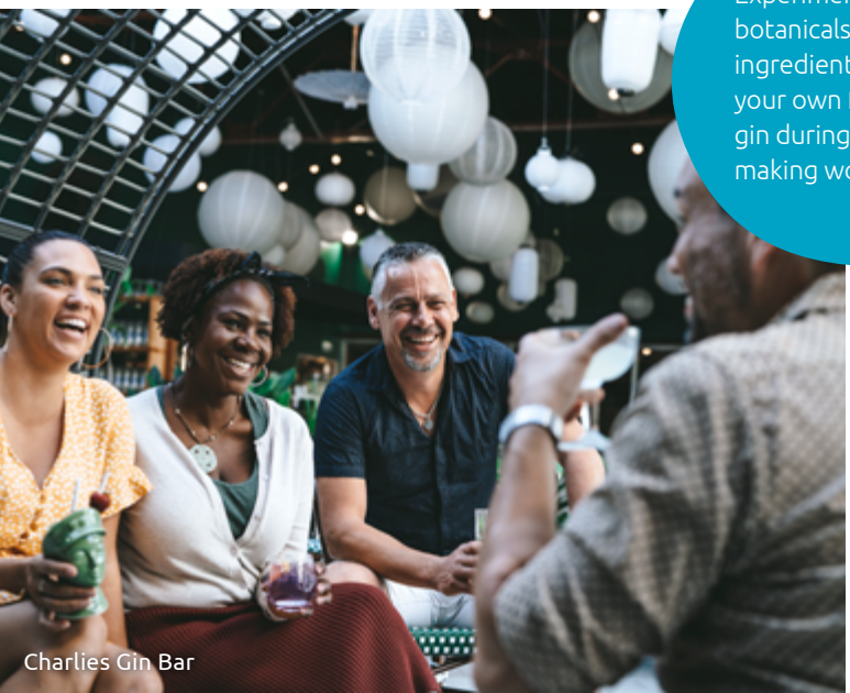
Charles Gin Bar

Indulge your senses at Mindil Beach Sunset Markets with a VIP package including sunset drinks, mouth-watering canapés and 'Mindil Money' to spend at the diverse range of market stalls.