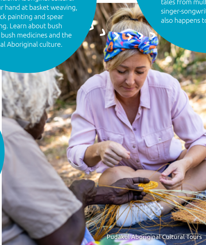
Pudukul Aboriginal Cultural Tours

Spend time on-country with Traditional Owners from Pudukul Aboriginal Cultural Tours and learn fascinating insights into their ancient Aboriginal culture. Try your hand at basket weaving, clap stick painting and spear throwing. Learn about bush tucker, bush medicines and the rich local Aboriginal culture.